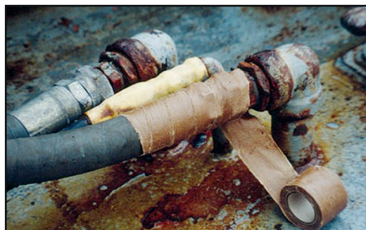
PCS Tape is wrapped on fittings. 50% overlap recommended.