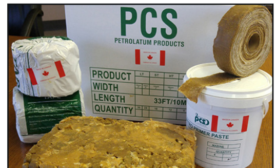
Related products include Petro Filler, PCS Primer and Mastic and Filler.