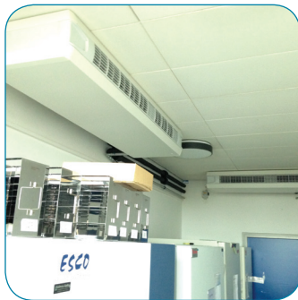
Two fan coils

The second phase was to use the DELTA T Control System to monitor and control the set point \Delta T for the same installation.