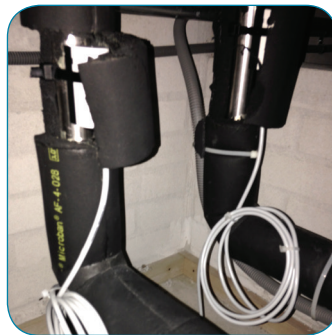
DELTA T temperature sensors