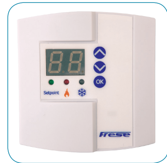
DELTA T control unit